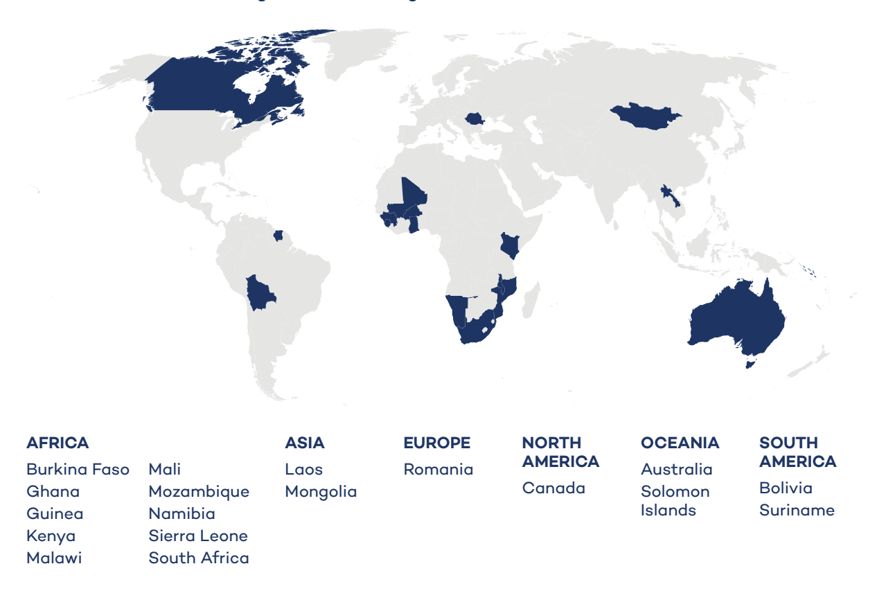
FIGURE 4. Countries using SEA for mining initiatives

All continents have countries that already use SEA for mining: in mining policies specifically and in spatial planning for areas where mining is an important factor (see Figure 4 for a noncomprehensive overview).